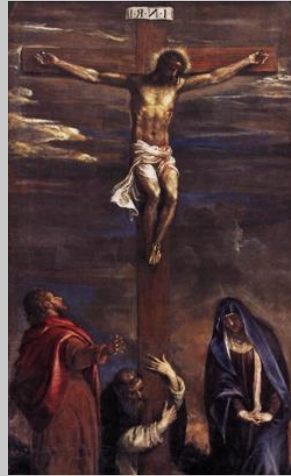
Crucifixion of Jesus— Titian