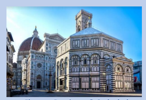
Florence Baptistery & Cathedral