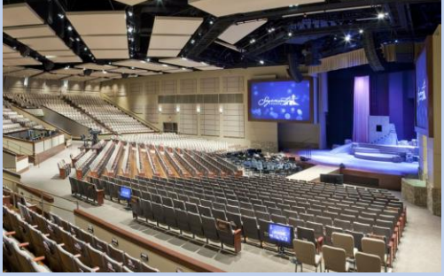
Sagemont Church, Houston