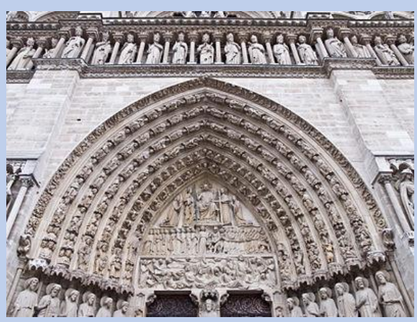
Notre Dame (Paris) Front Entrance